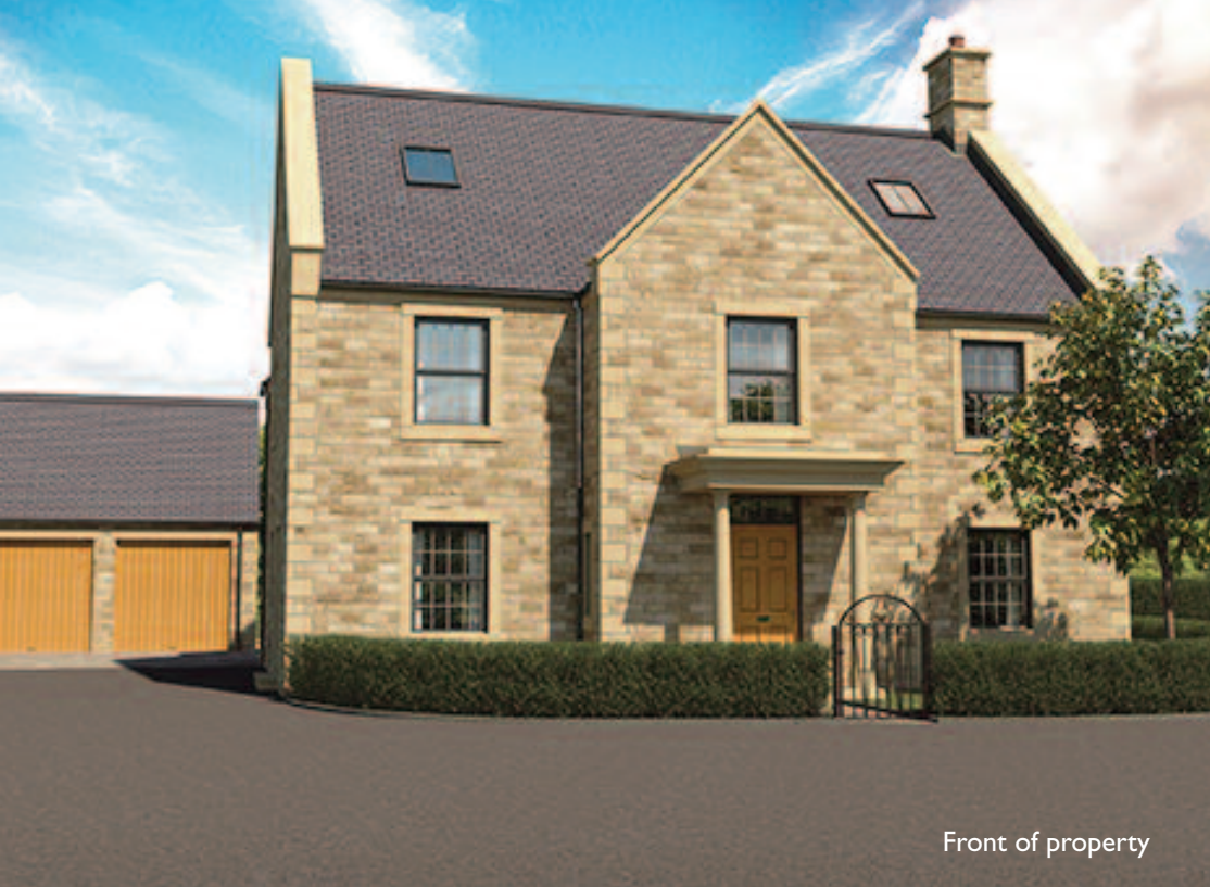
Front of property