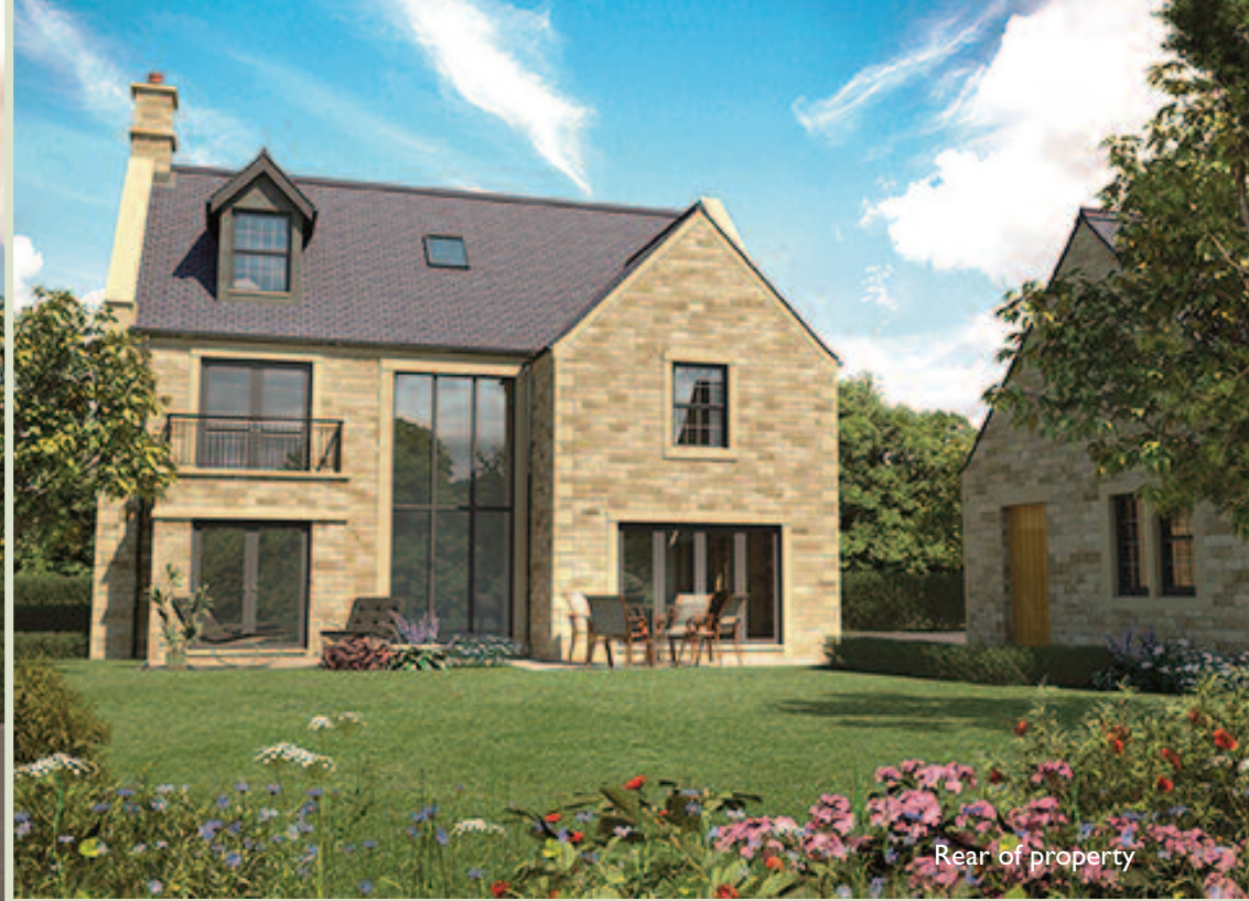
Rear of property