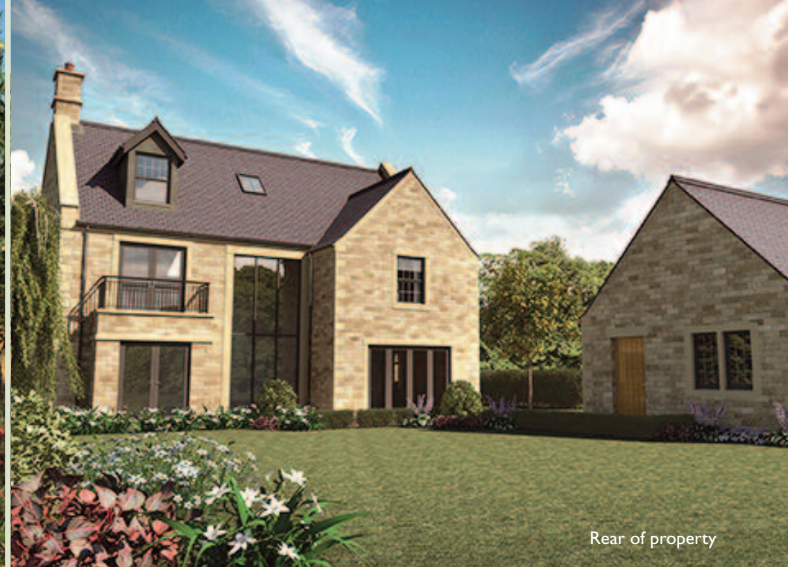
Rear of property