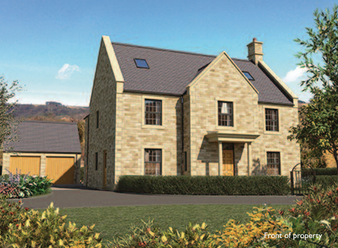
Front of property